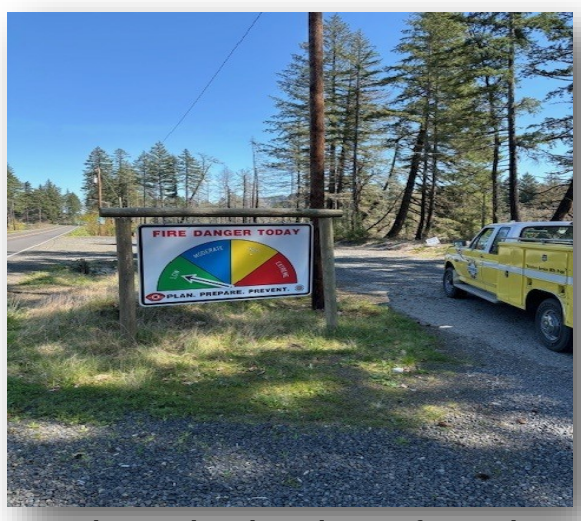
Located on North Fork Road just up from Highway 22.

Thank you OSFM for providing Stayton Fire District a new Fire Danger sign!