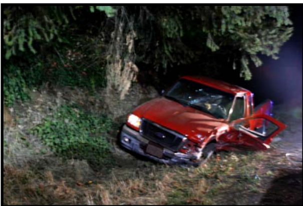
MVA Hwy 22 on Friday Sept 16 near Mehama.