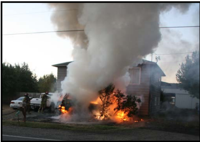
MVA, West Stayton Rd, September 12

THANK YOU to all our emergency responders: police officers, firefighters, EMT's, 911 dispatchers, and search and rescue volunteers.