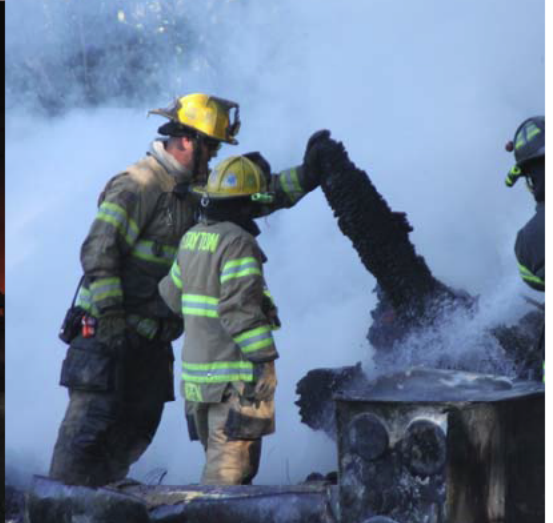
And responding to structure fires and MVA