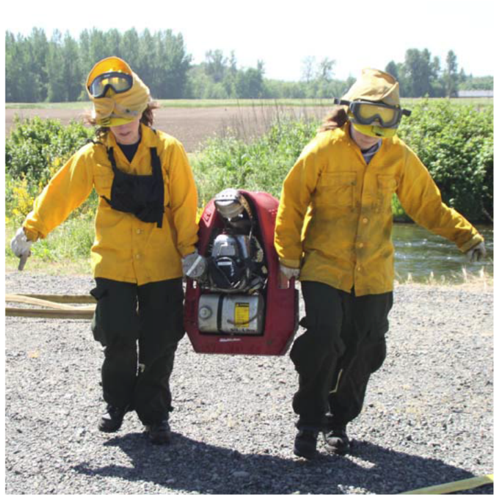
Firefighters training for wild land fire fighting