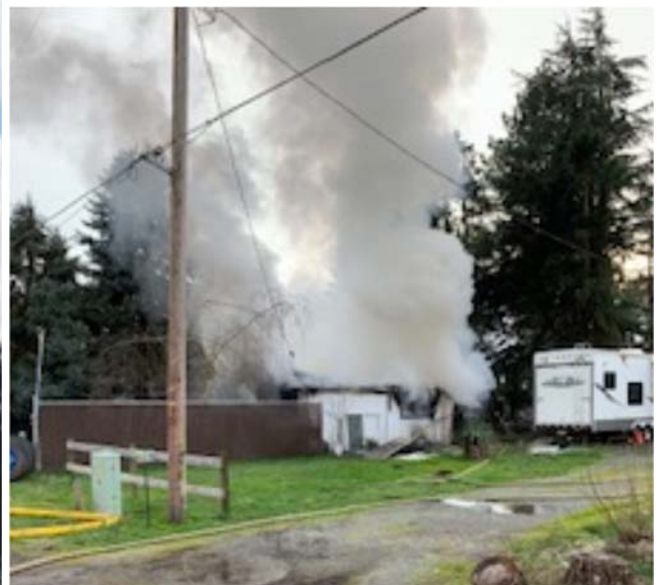
House Fire on McClellan Lane