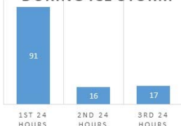
FIRE DISTRICT CALLS AND RESPONSE DURING ICE STORM

Thank you and "well done" to our volunteers and staff for the many exhausting, labor-intensive hours you put in for your community.